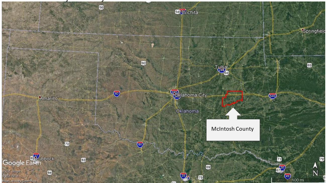
Attachment 1: Project vicinity.